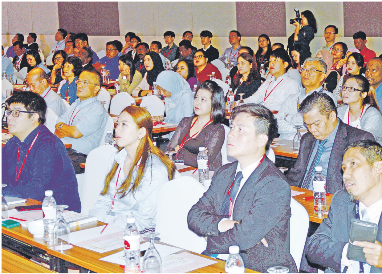
A section of the participants during the Supply Chain Conference For East Malaysia MIDA at UCSI Hotel, in Kuching yesterday.

tion of these priority industries, the state government through its various agencies particularly Regional Corridor Development Authority (RECODA) will intensify our efforts in improving physical development as well as investment promotion and marketing for these industries.