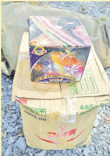
AMONG the boxes loaded with smuggled firecrackers and fireworks found at the scene.

Further investigations had found that the six containers located in the open space containing various firecrackers and fireworks were estimated