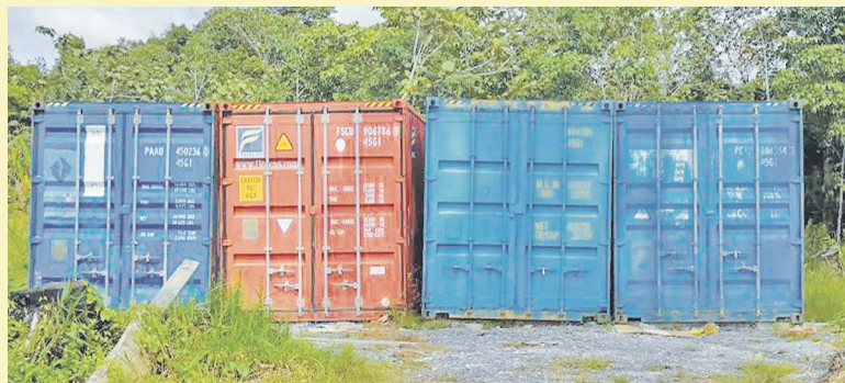
FOUR of the six containers loaded with firecrackers and fireworks smuggled through Limbang.

multinational corporations (MNCs) and large local corporations (LLCs) located here, and the very fact a few big names such as OCIM, X-Fab, Huchems Fine Chemical, LONGi, Comtec, Press Metal, Cahya Mata Sarawak and Shin Yang Industries have made significant investments in Sarawak hold much promise for business collaboration and opportunities within this region," he said.