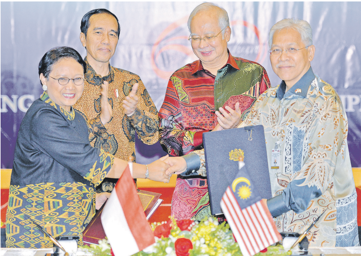
PRIME Minister Datuk Seri Mohd Najib Tun Razak (right) and President of Indonesia Ir. H. Joko Widodo witnessing the exchange of MoU document between the Government of Malaysia represented by Minister of Higher Education Dato' Seri Idris Jusoh and Government of the Republic of Indonesia represented by Retno L.P. Marsudi Minister of Foreign Affairs Indonesia on the cooperation in the Field of Islamic Higher Education in Hilton Hotel, Kuching yesterday.

announced the remanded fishermen who encroached into both nations' waters to fish illegally will be released as soon as possible.